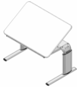
Type B 90x60cm Item No. 20-60211 50-70cm 20-60221 60-90cm