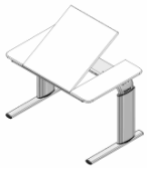
Type E 90x60cm Item No. 20-60214 50-70cm 20-60224 60-90cm

Several sizes to suit individuals and carers needs.