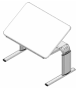
Type B 90x60cm Item No. 20-60011 50-70cm 20-60021 60-90cm