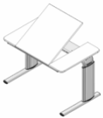
Type E 90x60cm Item No. 20-60014 50-70cm 20-60024 60-90cm

Several sizes to suit individuals and carers needs.